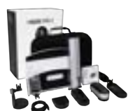
i1Basic Pro 3

Display profiling Use with 3rd party RIP/Software