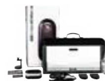
i1Publish Pro 3 Plus

Display Profiling Printer profiles on smooth papers