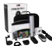
i1Publish Pro 3

Display profiling Use with 3rd party RIP/Software on speciality substrates