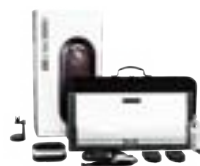
i1Basic Pro 3 Plus

Display profiling Use with 3rd party RIP/Software